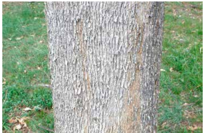
Grey Box Eucalyptus moluccana can be identified by this distinctive bark

The Hawkesbury-Nepean Catchment Management Authority (HNCMA) was formed to help protect the natural values of the Hawkesbury-Nepean and ensure it continues to be a healthy and productive catchment.