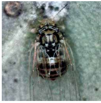
An adult Grey Box Psyllid