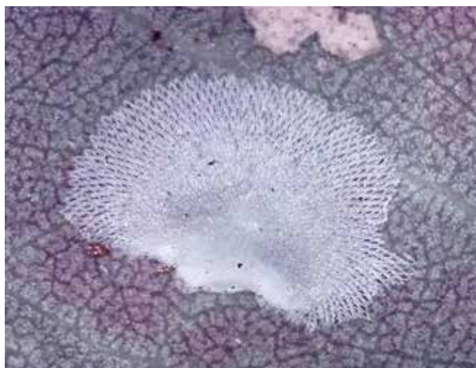
A Grey Box Psyllid lerp - the unique covering protecting the feeding larva

While some psyllid species have associations with Bell Miner birds this is not the case with Grey Box Psyllid.