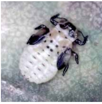
A larval psyllid exposed