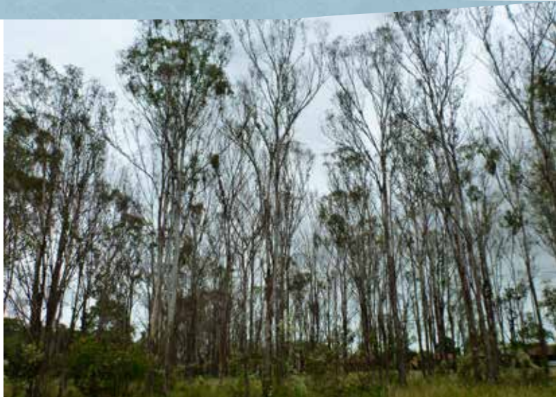
Cumberland Plain Woodland damaged by Grey Box Psyllid